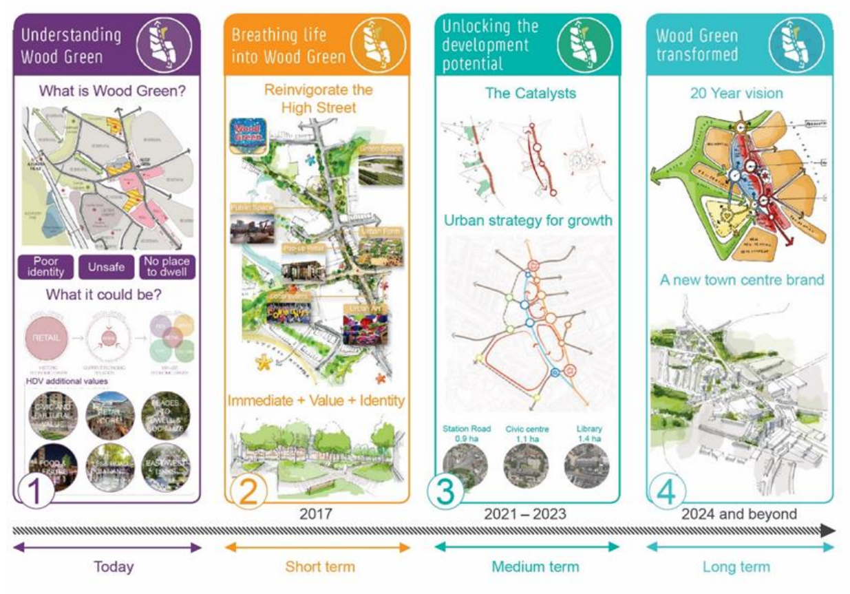
Figure 1: The three catalyst sites are just one step in the journey to a revitalised town centre.

The revitalisation of Wood Green is a long-term project in which the HDV has the opportunity to not only redevelop the red-lined (Bid) sites, but also to work with the Council and third-party landowners to strengthen the town centre as a whole. Three main steps have been identified for transformation in the short, medium and long term as illustrated below: